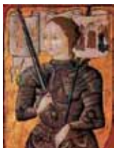
St. Joan of Arc

St. Joan of Arc is the patroness of France and of soldiers. Joan was born on January 6, 1412 to pious parents of the French peasant class, in the obscure village of Domremy, near the province of Lorraine.